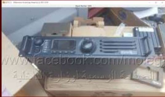
Hytera RD98X repeater