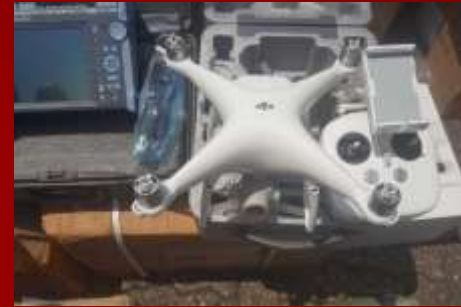
DJI Phantom 4