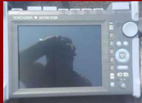
Yokogawa AQ7280 (optical fiber test device – not listed in press release)