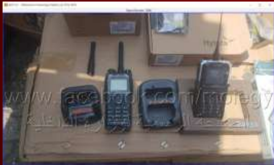
Hytera two-way radios