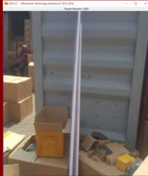
base station antennas